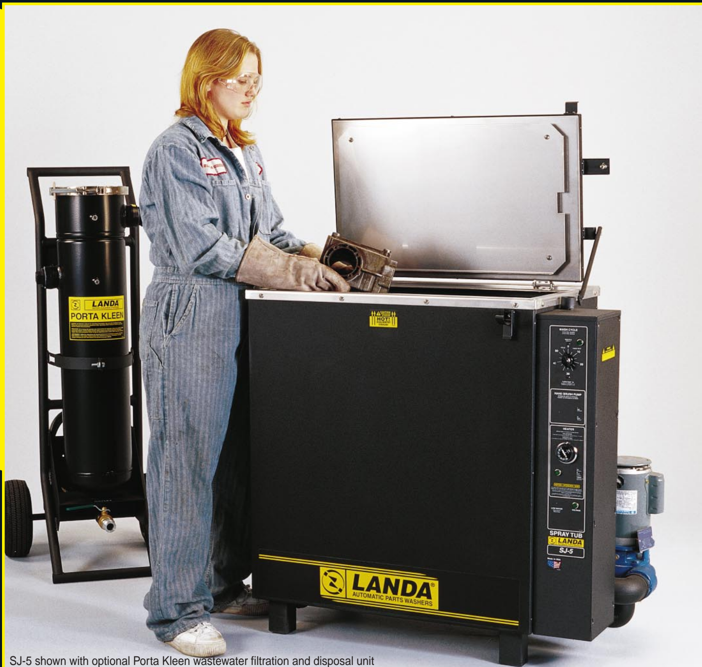
SJ-5 shown with optional Porta Klean wastewater filtration and disposal unit

1-YEAR LIMITED WARRANTY • CERTIFIED TO UL SAFETY STANDARDS • ISO-9001 COMPANY