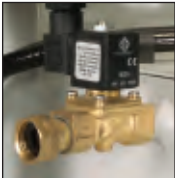
Auto Water Fill replenishes tank water level automatically