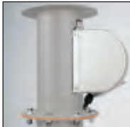
Steam Exhaust Fan enhances steam vapor extraction