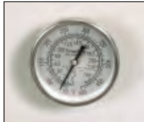
Temperature Gauge monitors temperature of cleaning solution.

• Bag Filtration extends life of cleaning solution by filtering suspended solids