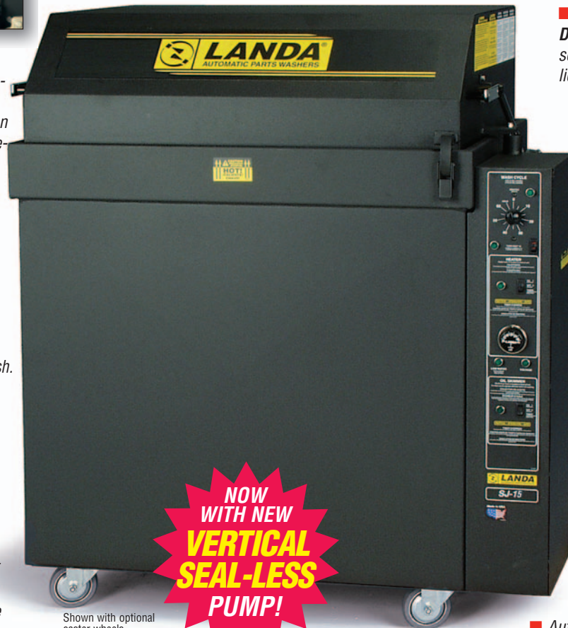
Shown with optional caster wheels

■ Manual Latch locks lid closed when pump is operating for added operator safety.